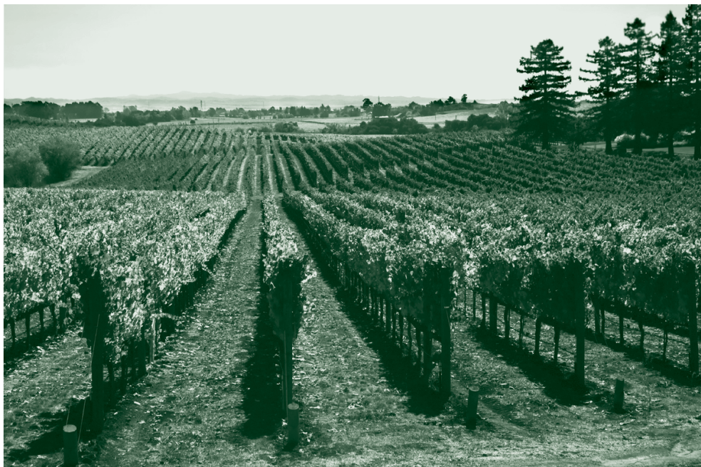
California produces more than 90 percent of U.S. wine and supplies about two-thirds of the wine consumed in the United States.

Table 4 shows that in most cases, the cross effects are small—less than two percent. However, there were some instances associated with significant cross effects. The highest cross effects are identified in district 4 (Napa) for Cabernet Sauvignon,