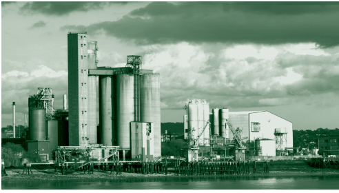
It appears that much of the worsened water quality is due to pollution from various industries.

caused by construction, the electrical industry, and fertilizer runoff. Most likely the association between this ethnic group, which is higher in population share in counties such as Alpine and Inyo, and these two pollutants are due to allowing industry to enter their communities to create jobs.