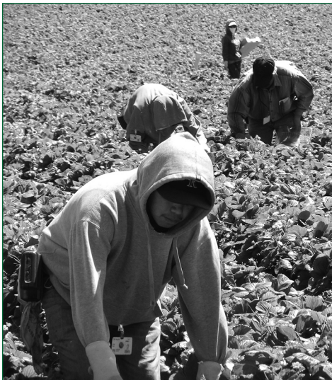
Migrant farmworkers plant and pick most of the fruits and vegetables that we eat.

The share of agricultural workers who migrate within the United States has fallen by about 60% since the late 1990s. This reduction in the number of migrant farmworkers increases the risk that fruits and vegetables will not be harvested before they spoil. On average over this period, one-third of the drop in the migration rate was due to changes in the demographic makeup of the workforce, while two-thirds was due to government and institutional changes in the market. However, in recent years, demographic changes were responsible for nearly half of the overall change.